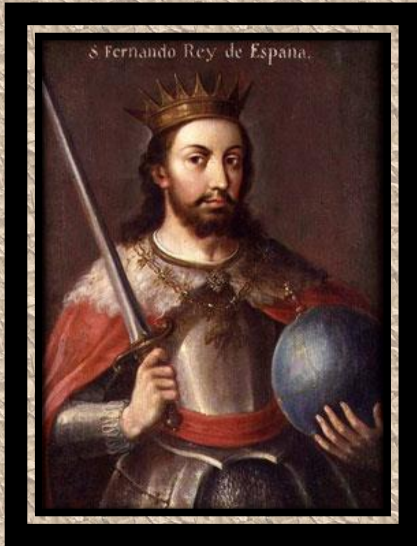
St. Ferdinand III of Castile 1199 – 1253