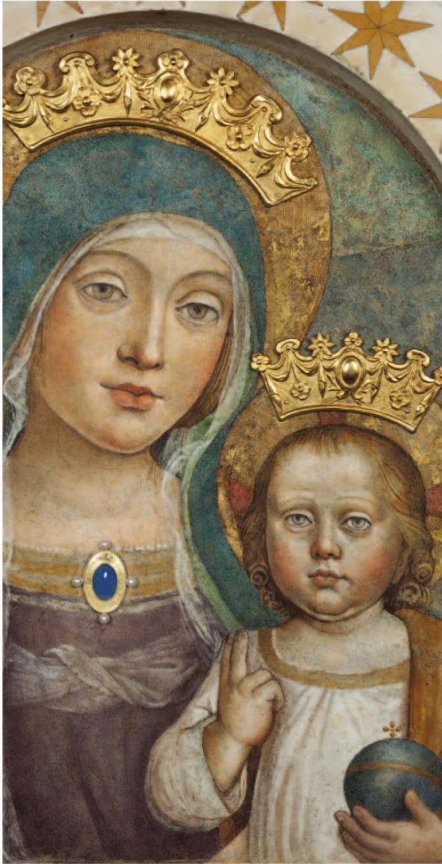
The ancient fresco of Madonna del Soccorso (Our Lady of Help) in St. Peter's Basilica was restored with the support of the Knights of Columbus to mark the Year of Faith (2012-2013).

O Mary, you always brighten our path as a sign of salvation and of hope. We entrust ourselves to you, Health of the Sick, who, at the Cross, took part in Jesus' pain while remaining steadfast in faith.